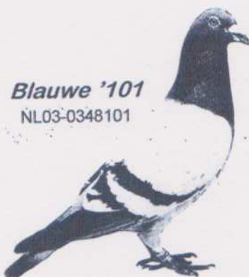
Blauwe '101 NL03-0348101